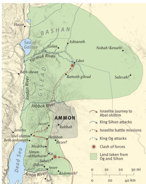
Israel Defeats Og and Sihon (ESV Study Bible) (Click to Enlarge)